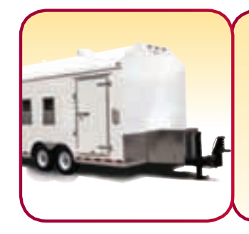
Curb Side Personnel door Allows quick and easy access to

Optional dc power resistive load bank available for conducting NERC compliant battery discharge tests. Various sizes are available; please consult factory.